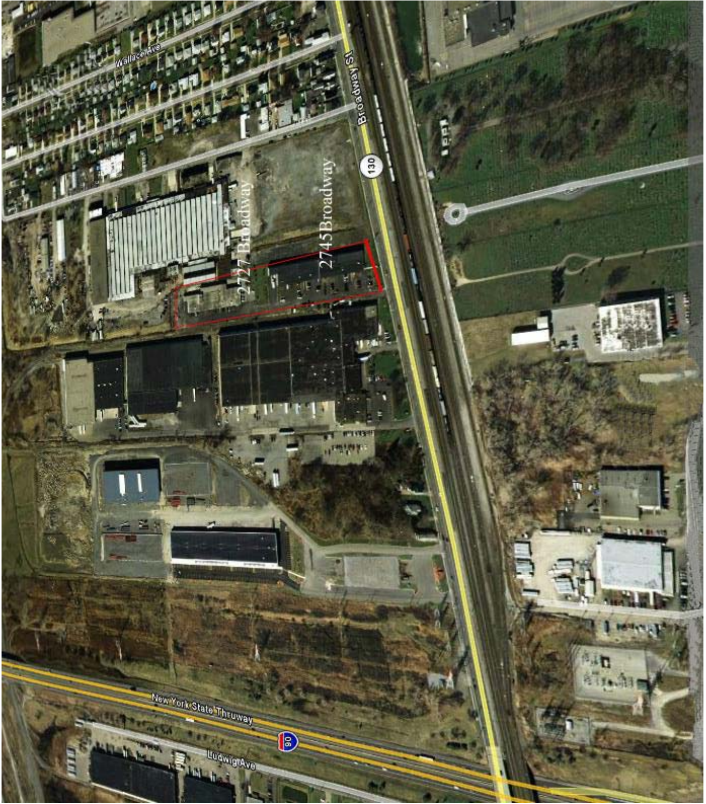
Aerial View of Broadway Industrial Center